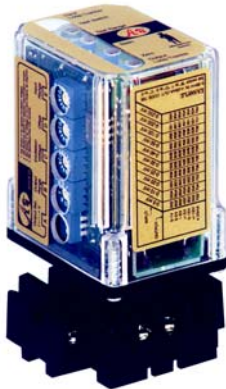
API 4058 G

Solution: API furnished the customer an API 4058 G . The API 4058 G provides the excitation power to the load cell and is fully field range able for the excitation supply, sensitivity (output from the transducer) and DC current output. The unit is hot swappable so any system down time can be eliminated. The output 4-20mA signal was sent to their control system for indication and to maintain the proper “weight” for the transported cargo.