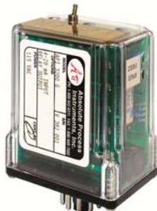
API 3200 G M420

Note: An alternate solution is to use the APD 3200 M420