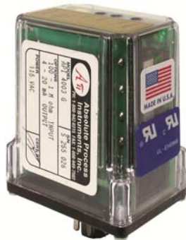
API 4003 G I

Solution: Since the customer requires “hot swap-ability” it was recommended that they use an API 4003 GI D EXTSUP. This allows the customer to use a common power supply for all of the various inputs to the RTU card on the HSQ Technology SCADA system and since it is a “plug-in” module it gives the customer the “hot swap-ability”. An alternate solution for a customer would be the APD 4008.