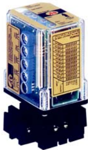
API 4059 G M02

Solution: API furnished the customer an API 4059 G M02. The API 4059 G M02 provides the excitation power to the melt pressure transducer and is fully field range able for the excitation supply, sensitivity (output from the transducer) and DC current output. The API 4059 G M02 uses state-of-the-art optical isolation, has NON-INTERACTIVE zero and span controls and has 20 V compliance (capable of driving 20 mA into 1000 ohms) so the output signal can be looped thru both the panel meter for local display and the PLC for control and recording. An added feature of the API 4059 G M02 is that it utilizes the pressure transducer's internal calibration resistor to unbalance the bridge to a specified value (typically 80% of full scale) when the functional test switch is in the CAL position, ensuring accurate system calibration.